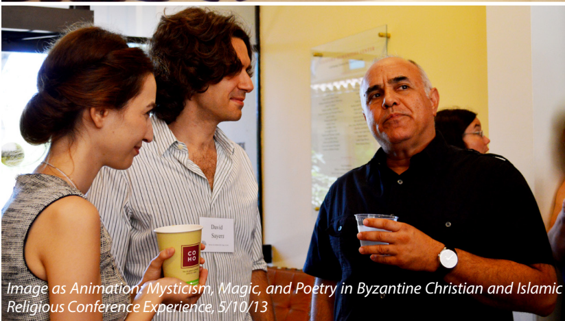
Image as Animation: Mysticism, Magic, and Poetry in Byzantine Christian and Islamic Religious Conference Experience, 5/10/13